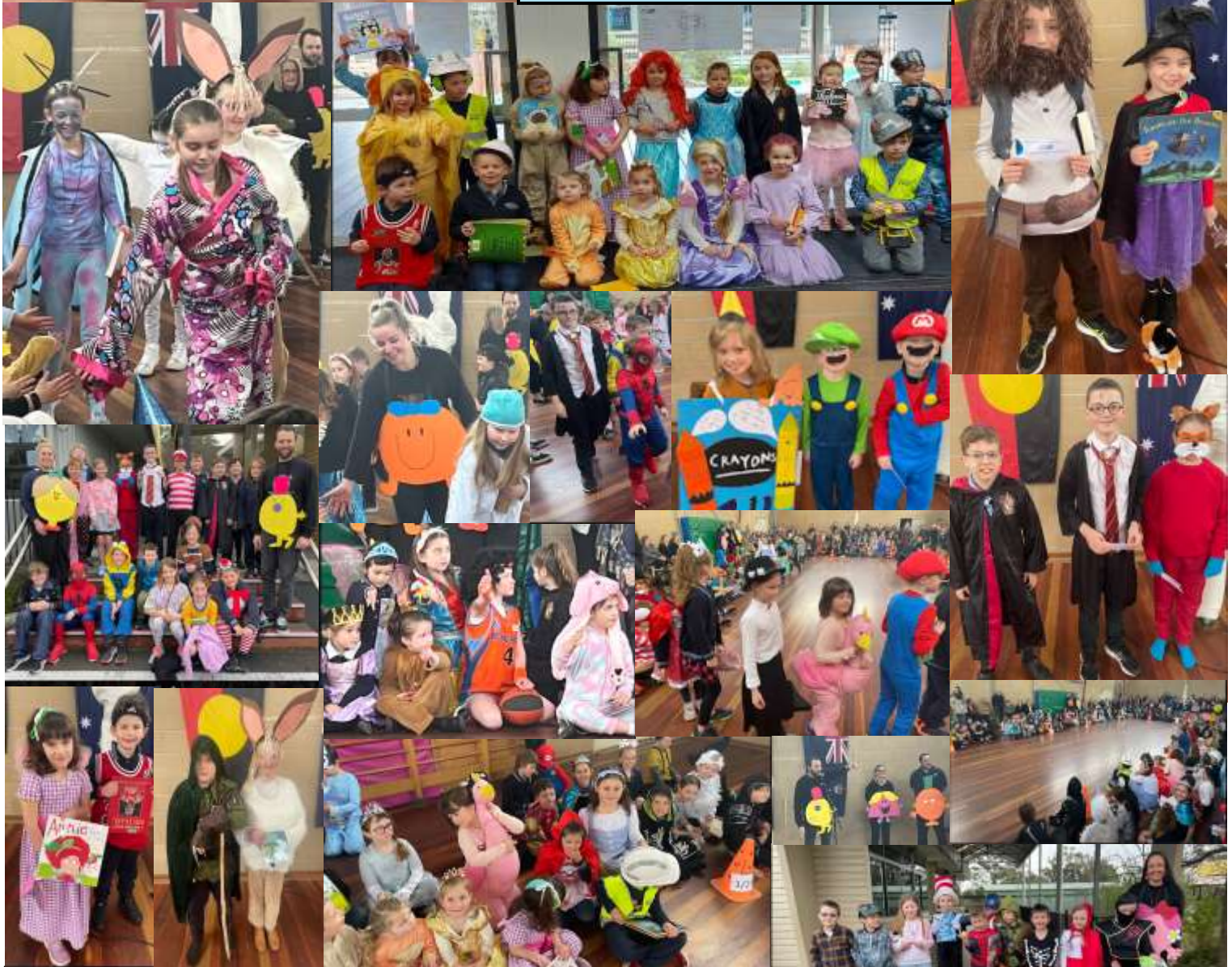
Book Fair Week Monday 22nd August — Friday 26th August